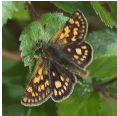
Chequered Skipper

We also visited a second national nature reserve the following day - at Ariundle oakwood, where in 2005 the Chequered Skipper had been seen in very large numbers. However we were not so lucky, although this is a magical place to visit, being the nearest I have ever come across to the sort of wood envisioned by Tolkien for the elves in Lord of the Rings.