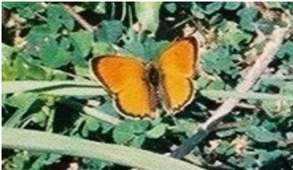
Scarce Copper (Dave Chandler)

Large White, Small White (lookie-likey), Bath White, Brimstone, Clouded Yellow, European Swallowtail (lookie-likey), Common Blue, Silver Studded Blue (lookie-likey), Sooty Copper (lookie-likey), & Scarce [&/or Large] Copper (lookie-likey).