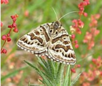
Mother Shipton

In the main compartment we saw a Brimstone, Mother Shipton, Silver Y Moth (2), Common Carpet and Small Heath. Small Copper was suspected, but not confirmed. After half an hour we moved off along